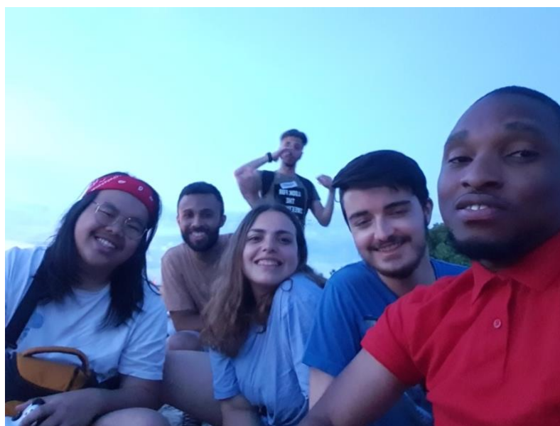
Picture 8: Experiencing the sunset at Kalamegdan with fellow interns

Festivals and public feasts are very common in Serbia. I had the opportunity to attend one of the biggest international festivals in Europe, the EXIT festival in Novi-Sad. Other festivals I attended and enjoyed included the Belgrade Beer Festival where I broke a record of tasting over 20 different beers in one night. Incredible. During two of the weekends I spent in the country, I took a trip to the warm springs in Krupaj, a city nearby Belgrade. It’s a 435m length stream that originates from a natural thermal source.